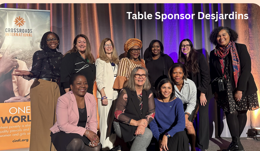
Table Sponsor Desjardins