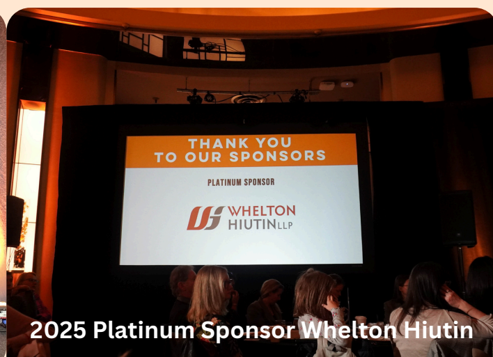
2025 Platinum Sponsor Whelton Hiutin